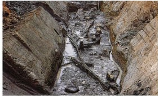
Reservoir remains where the wood strip and construction materials were found

The reservoir remains are situated in a valley on the northwest side of the Choujbaru district and covers an area of 5,300m 2 .